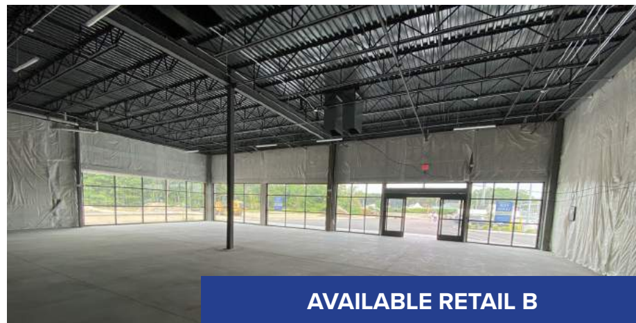
AVAILABLE RETAIL B