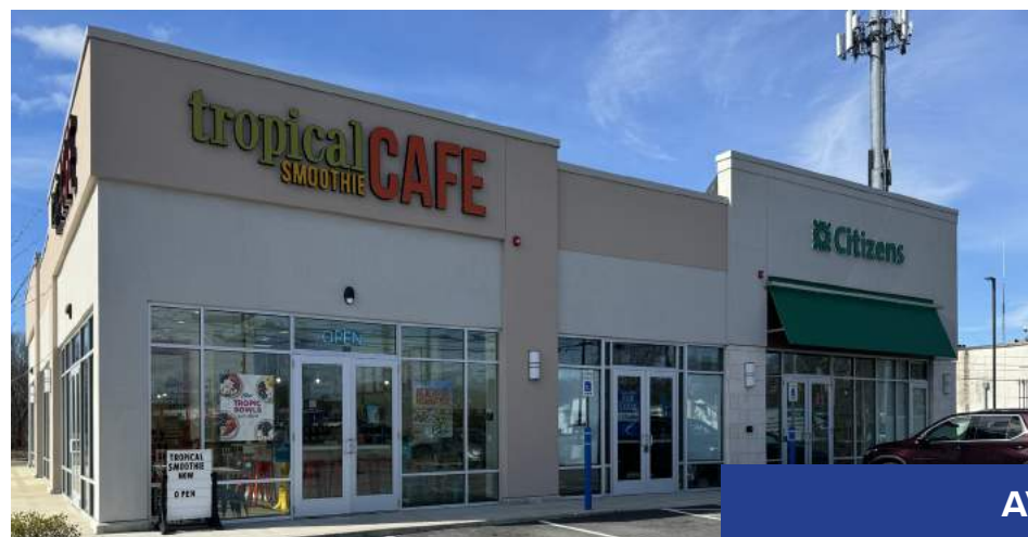
AVAILABLE RETAIL A