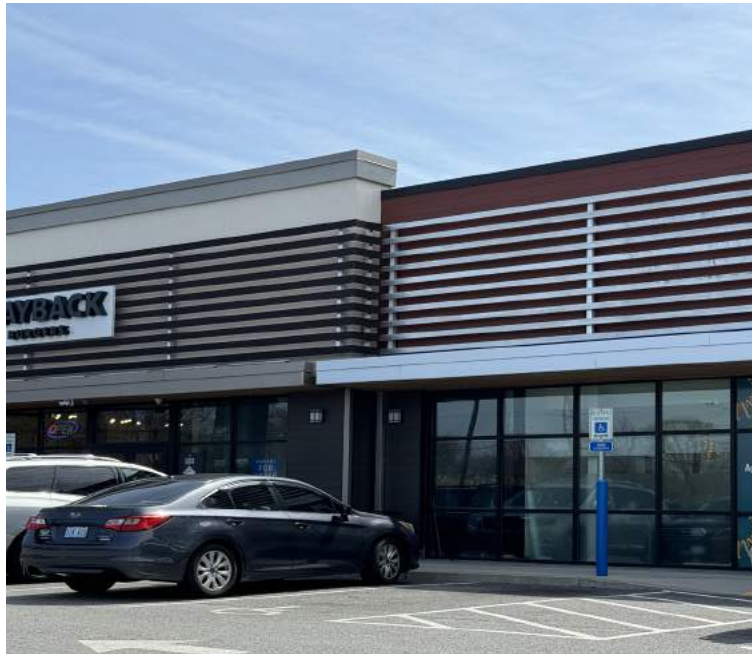
AVAILABLE RETAIL B