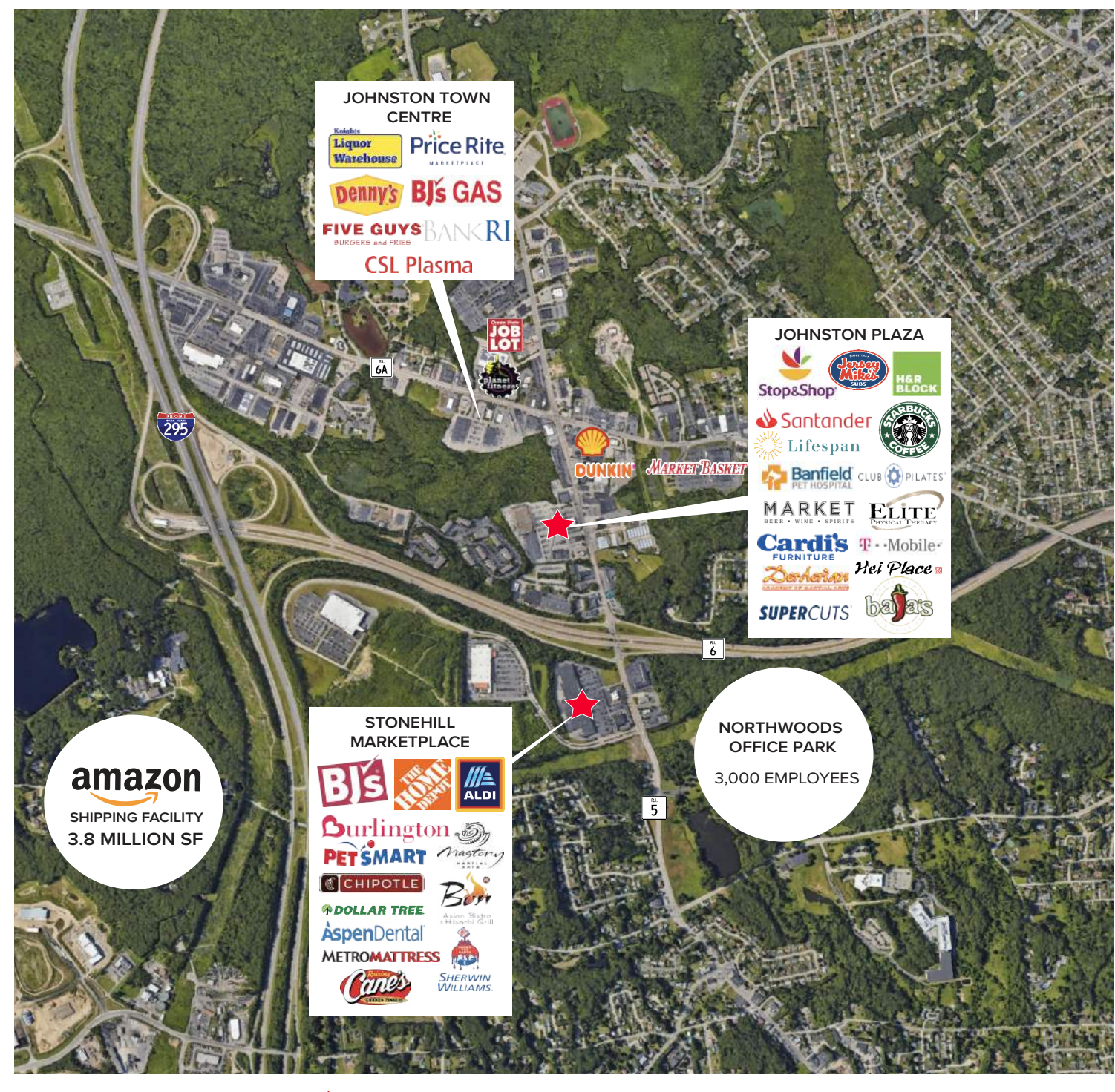
CARPIONATO GROUP OWNED PROPERTIES